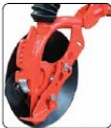
Single disc with adjustable depth limiter (supplied disassembled)